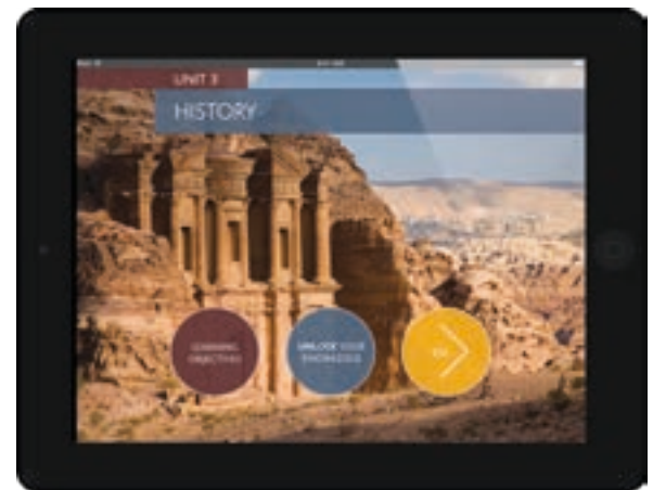
Unlock Student's Books are also available as ebooks with embedded audio and video, and interactive activities.

Learners engage in evaluative and analytical tasks that are designed to ensure they do all of the thinking and information-gathering required for end-of-unit tasks.